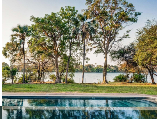
The Palm River Hotel

The Palm River Hotel is set upon the banks of the Zambezi River, just a few kilometers above Victoria Falls.