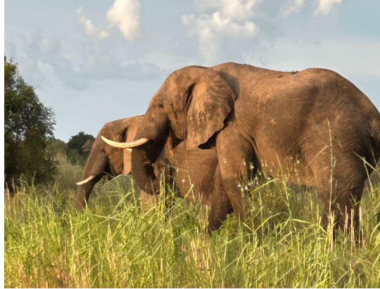
Zambezi River Cruise

The Zambezi River is the fourth-longest river in Africa, flowing through numerous game reserves and national parks. It provides sustenance to a diverse array of game, birdlife and fish species.